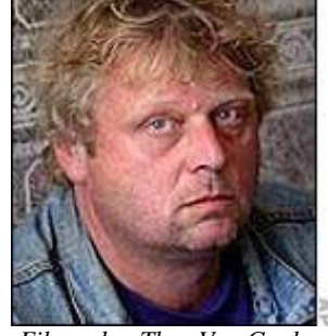
Filmmaker Theo Van Gogh