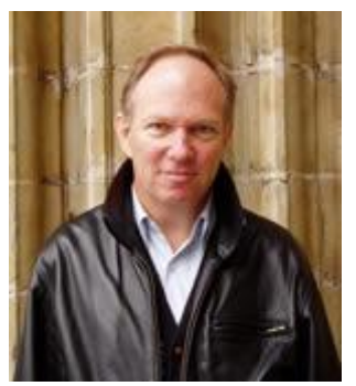
Author Ian Buruma