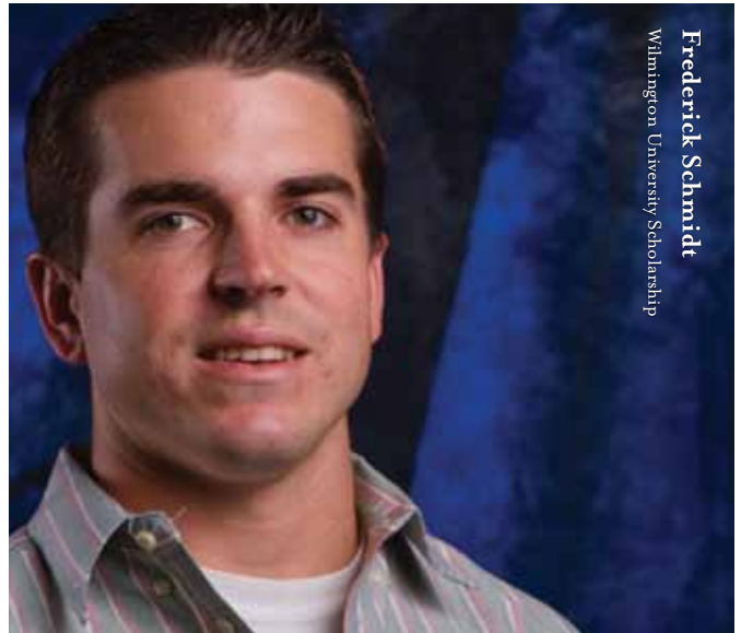
Frederick Schmidt Wilmington University Scholarship